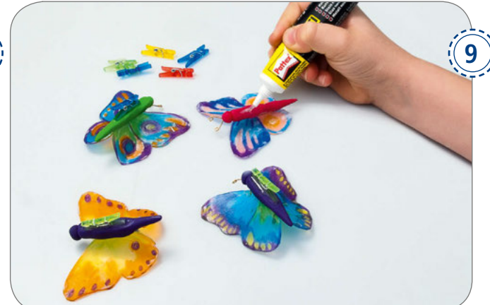
Once completely cool, stick small clothes pegs onto the butterflies using Pattex MULTI glue. That's it! Have fun decorating!