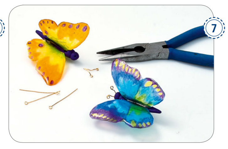
Take an approx. 4 cm long piece of wire, shape the ends to small eyelets and bend these towards each other to make a V. Stick the feelers in the head.