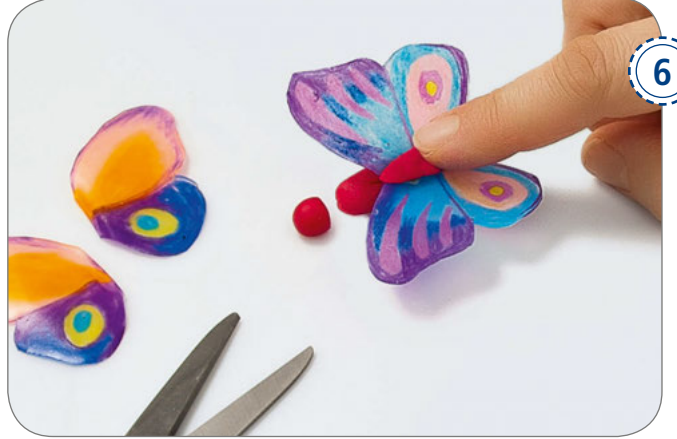
Separate the two wings by cutting down the middle line, stick into the opening with the smooth sides facing each other and press a thin roll of FIMO into the slit. Now attach the head. Make sure everything is pressed on firmly.