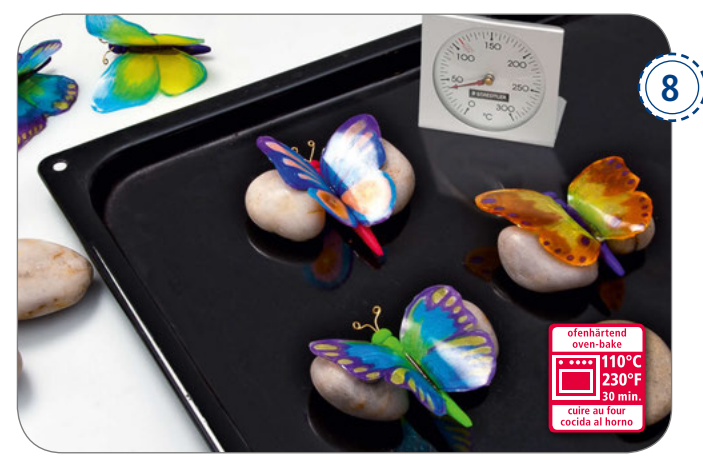
Put the butterflies on the baking tray and place small stones under the wings for support. Harden in the oven for 30 minutes at 110°C.