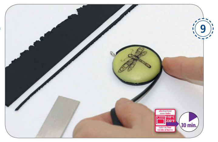
Roll out a long, thin stripe of black FIMO and use the rigid blade to cut off a straight 5 mm wide strip.

Now press the black sheet firmly against the medallion - this will ensure that the loop is well embedded.