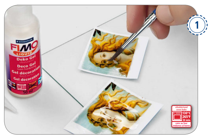
Make a laser copy of the chosen motifs. Use the brush to apply a thin coat of FIMO liquid all over the surface of 2 motifs. Harden in the oven for 20 minutes at 130°C.