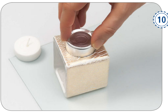
Use a tea-light holder to cut out a circle on two opposite sides of the lantern.