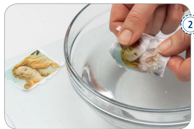
After hardening, place the motifs in lukewarm water and rub the layer of paper off approx. 5 minutes later. Before you continue, dry with a hairdryer or by dabbing with a cloth.