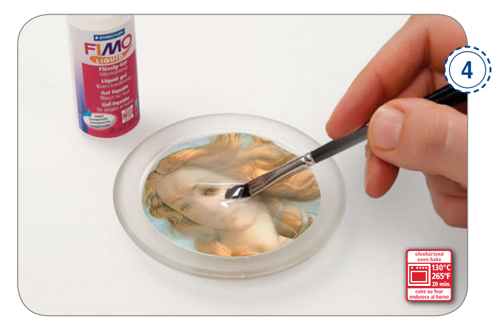
Spread the FIMO liquid evenly all over until the motif is fully covered. The layer should be approx. 1 mm thick. Now place the coaster in the oven and harden for 20 minutes at 130°C.