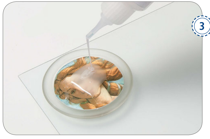
Pour more FIMO liquid into the coaster recess.

Add some FIMO liquid to the recess and spread it out with a brush. Afterwards, add the cut-out picture and press on evenly.