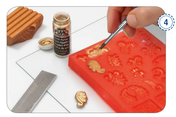
Brush a little gold metallic powder into the ,Ornaments' push mould, press gold FIMO effect into the recess and cut off any surplus material. Then carefully demould the motifs.