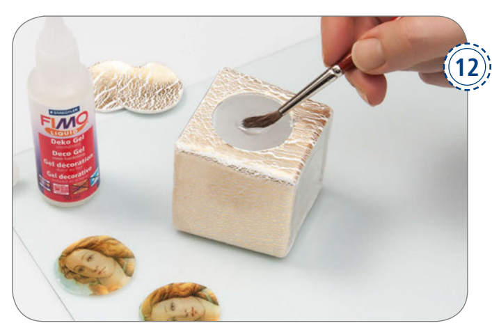
Brush a thin layer of FIMO liquid over the window, place the motif on top and press on to remove any air bubbles. Do the same on the other side.