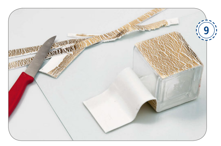
Lay the lantern on the sheet of FIMO and cut off a strip the same width as the lantern. Cover all sides with FIMO.