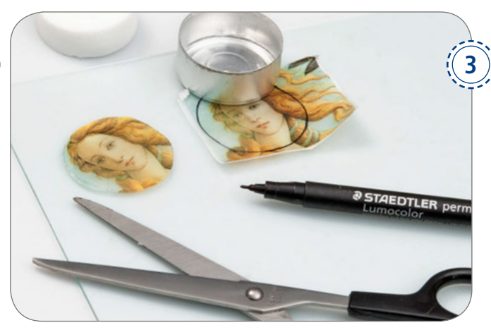
Once cool, draw a circle around the motifs by tracing around a tea-light.