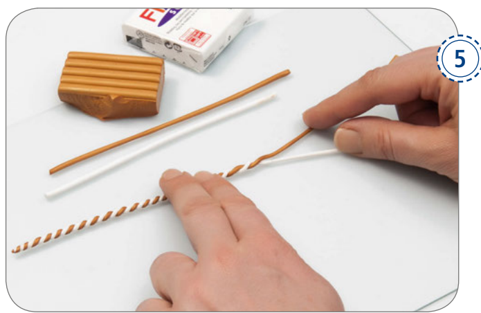
Use half a strip of gold FIMO to make an approx. 1 mm thick length of string and repeat the procedure with half a strip of white. Twist the two lengths of string together to create a cord.