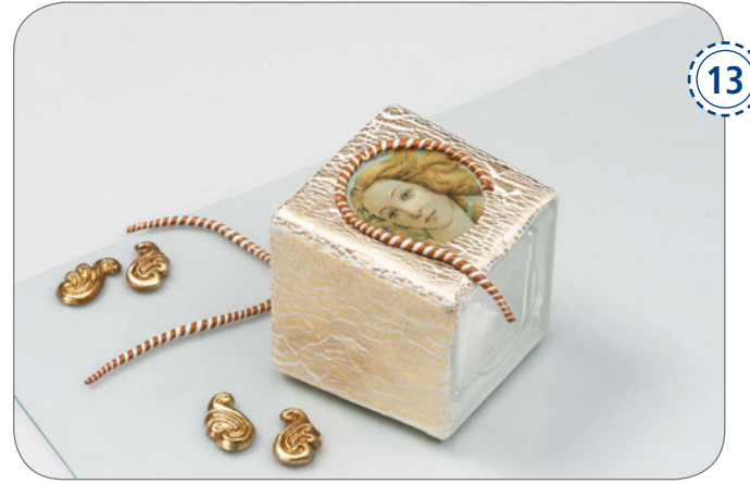
Position the FIMO cord around the medallion and add the ornaments. Press on gently. Do the same on the other side.