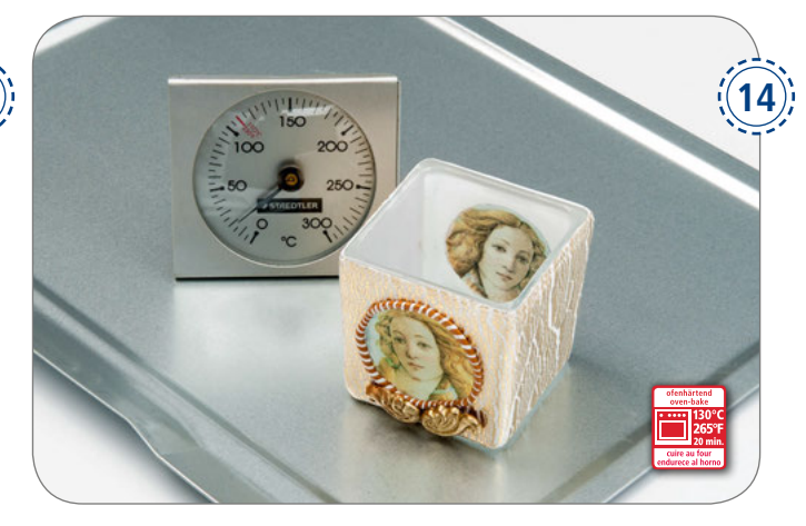
Then harden the lantern in the oven for 30 minutes at 110°C.